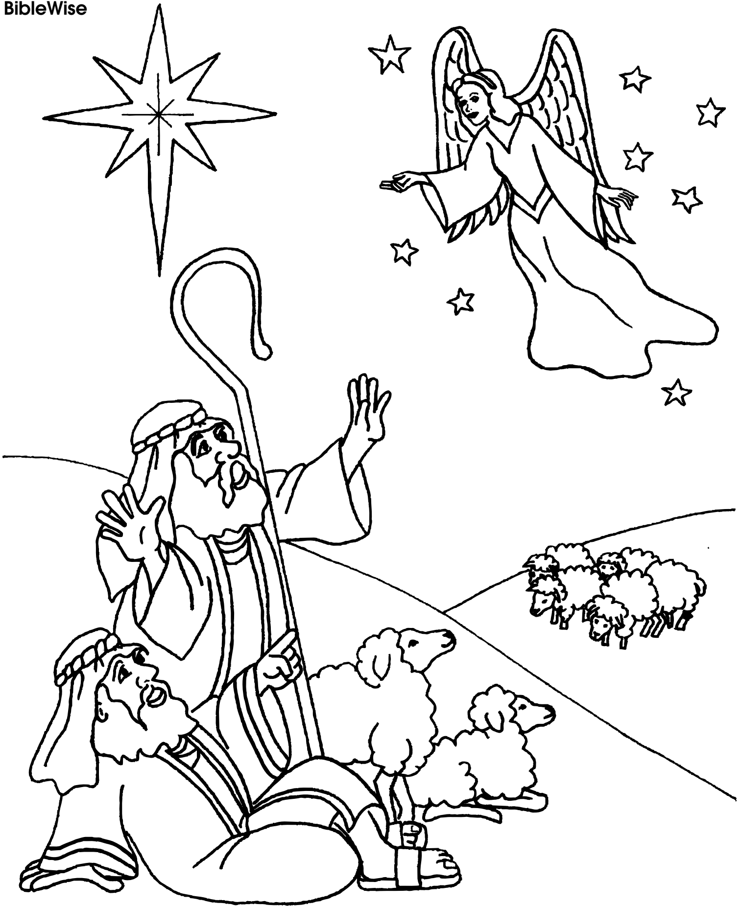
The Angel Telling the Shepherds the Good News