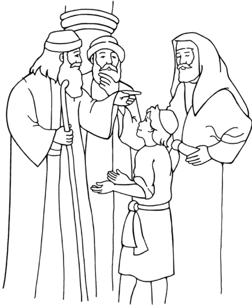
Jesus in the Temple Luke 2

Can you help Mary and Joseph find Jesus in the Temple?